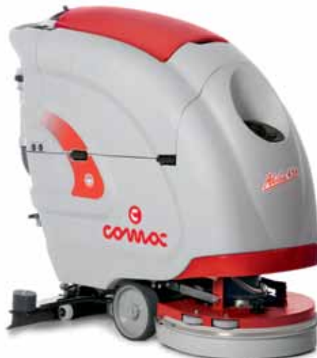
Abila 45 E-B