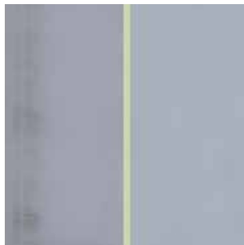
Abila with solution flow distributor

Uniform cleaning performance of the machine is achieved thanks to the special distributor that has been designed by Comac for twin-brush machines which ensures uniform flow of detergent solution even at low flow rates