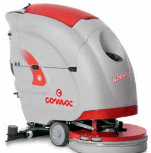
Abila 50 E-B-BT