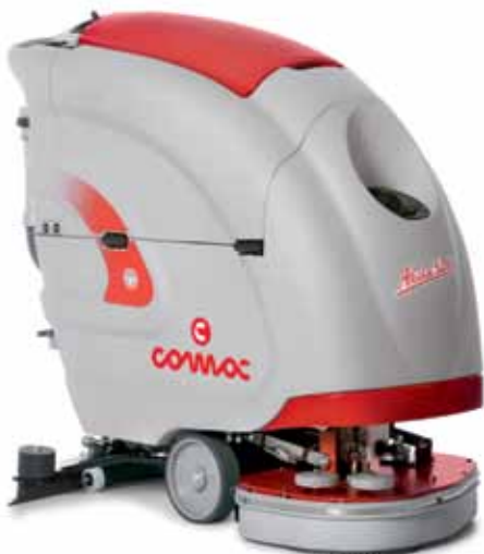
Abila 52 BT