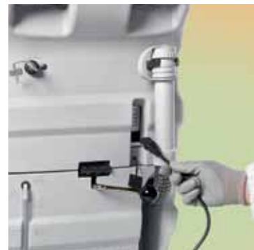
24V/9A on-board battery charger suitable both for gel and traditional batteries

On request, Abila (BT version) scrubbing machines can be supplied also with the practical on-board battery charger. For machine recharging, you just have to connect the cable that is supplied with the machine to a normal electrical socket so that maintenance procedures are made much easier at the end of every cleaning session.